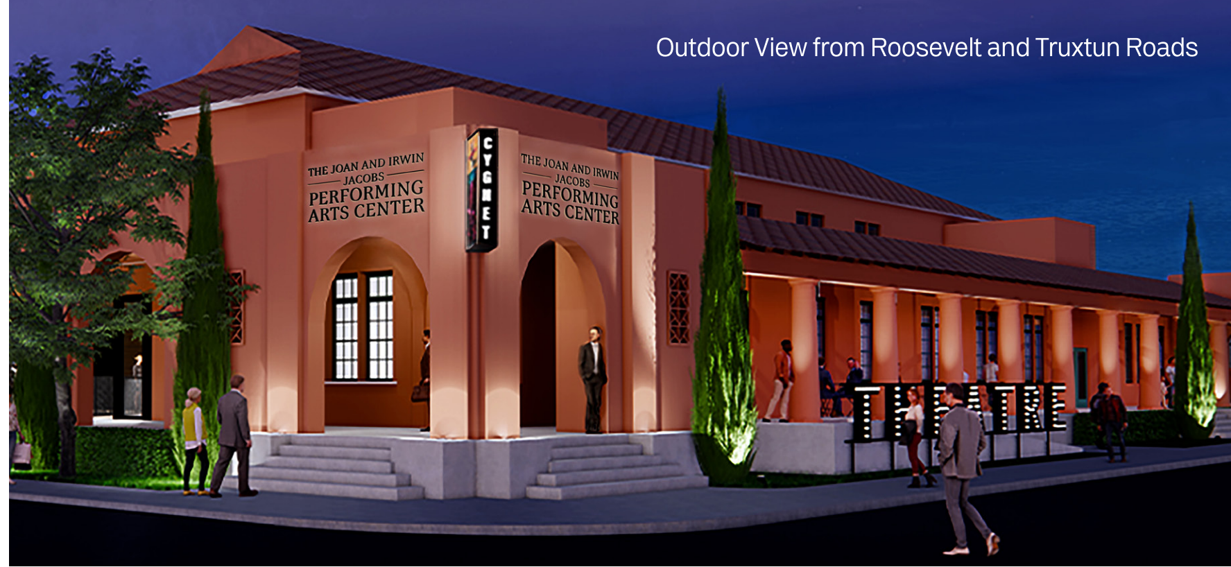
Outdoor View from Roosevelt and Truxtun Roads