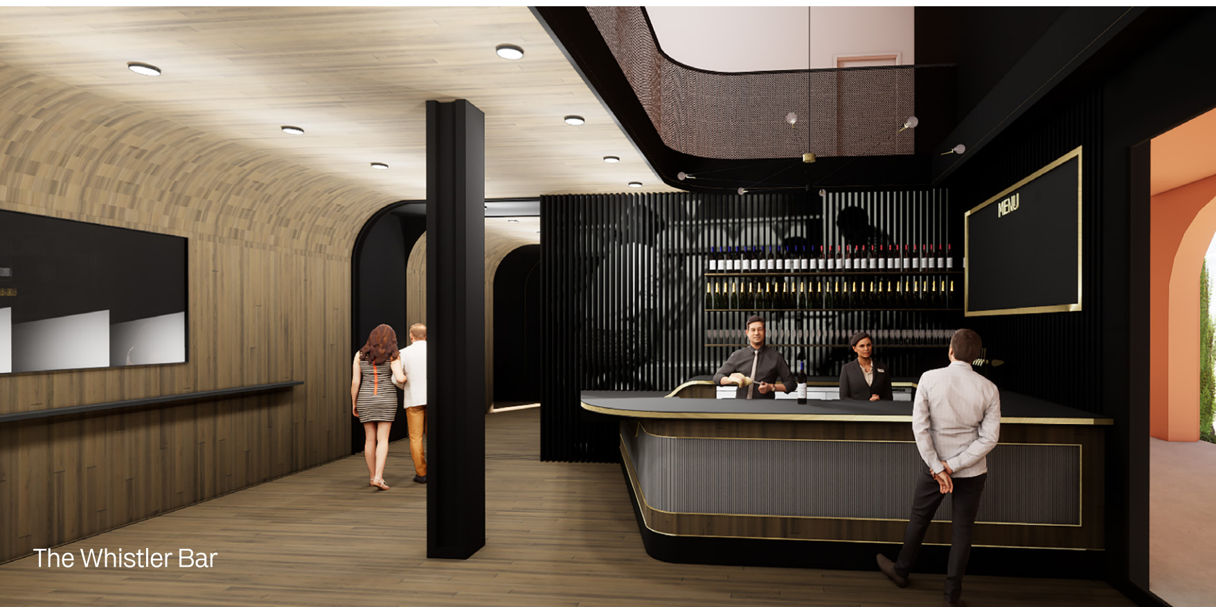
The Whistler Bar