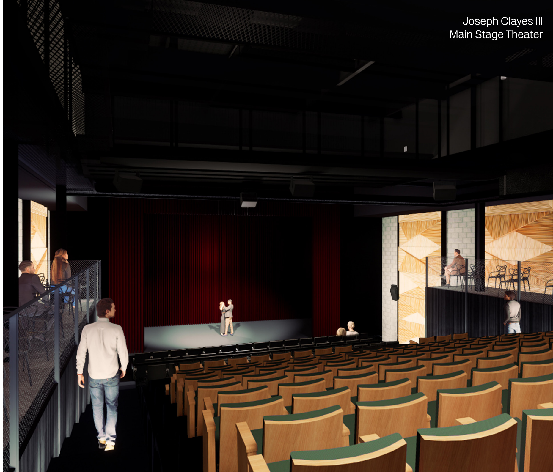
Joseph Clayes III Main Stage Theater