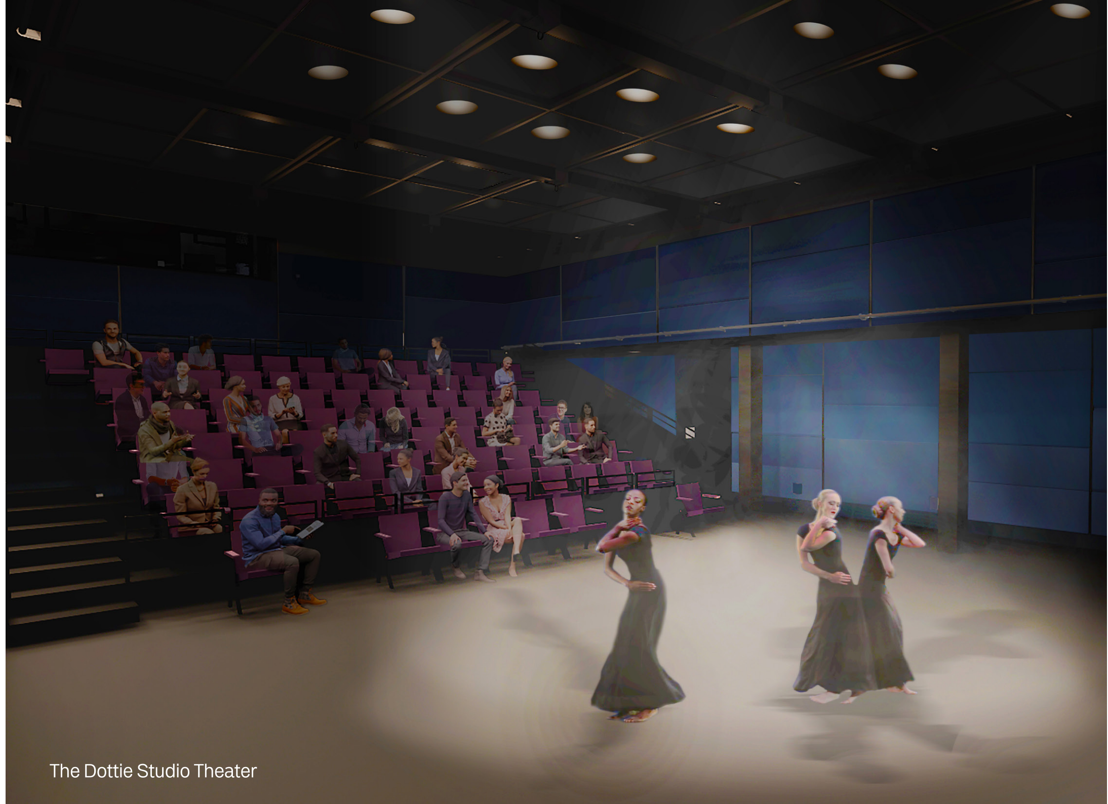
The Dottie Studio Theater