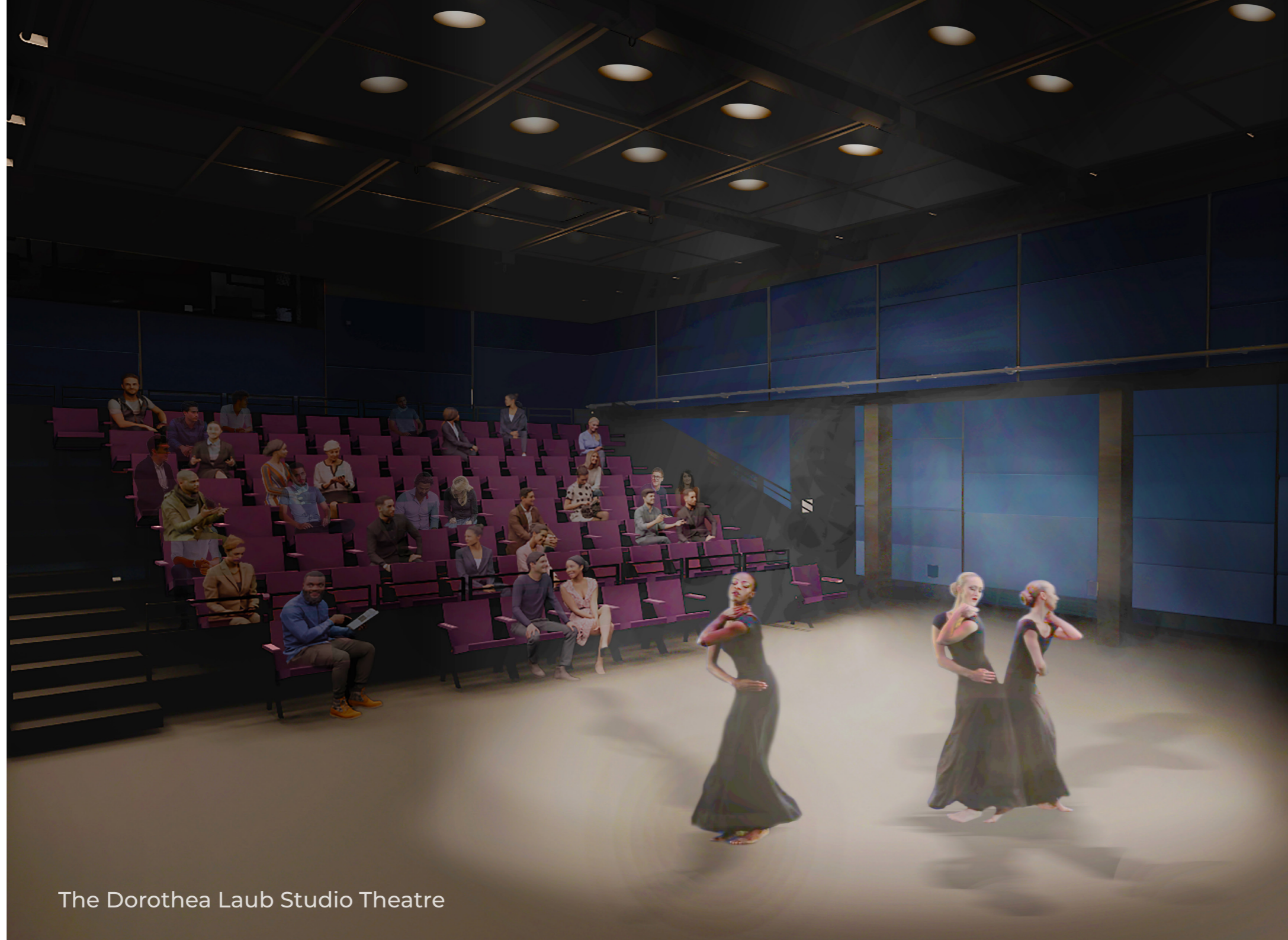
The Dorothea Laub Studio Theatre