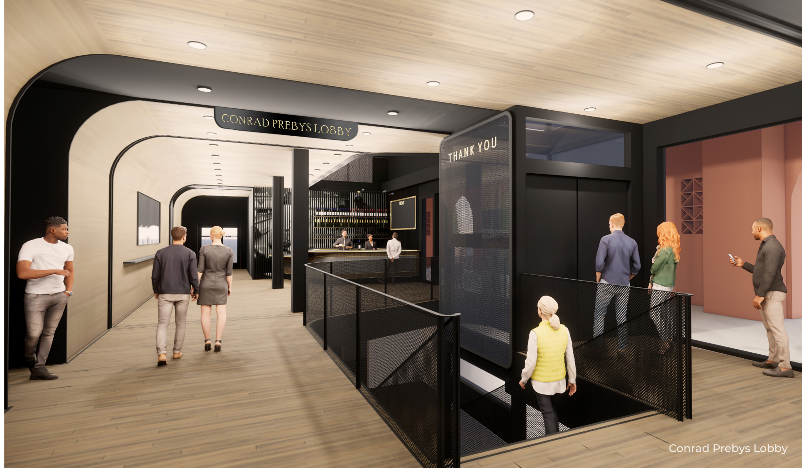
Conrad Prebys Lobby